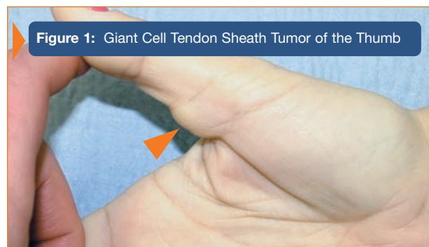
Figure 1: Giant Cell Tendon Sheath Tumor of the Thumb

Some patients may choose to do nothing and simply live with the tumor once they learn that it is probably benign. Typically, however, tumors get bigger with time and can become more of a nuisance. Patients should also consider the risks, benefits, and consequences if choosing not to have surgery. Hand surgeons can provide information and advice to allow patients to make the best decisions regarding their treatment plans.