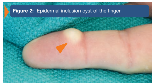
Figure 2: Epidermal inclusion cyst of the finger